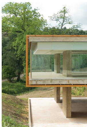
Tarik Oualalou Architect_Volubilis Archeological Museum_ photo©Elio Germani